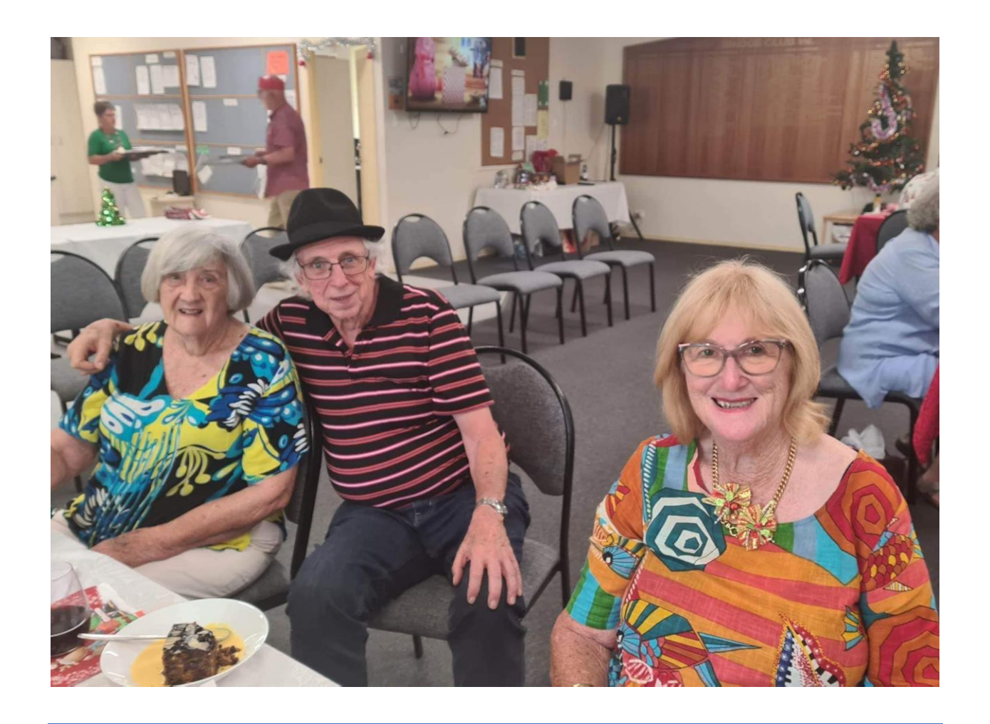
An then of course there was the "Whistle Ensemble"!!

Click on the "cloud" icon at the bottom of the video picture to view this if it does not open in your viewer